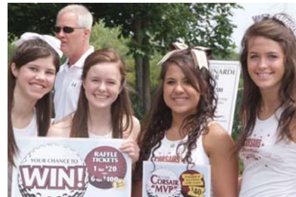
Cheerleaders lend their support to the raffle.